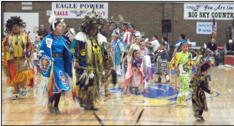
Fancy dancers perform at Missoula Youth Pow wow on March 26 at Big Sky High School.